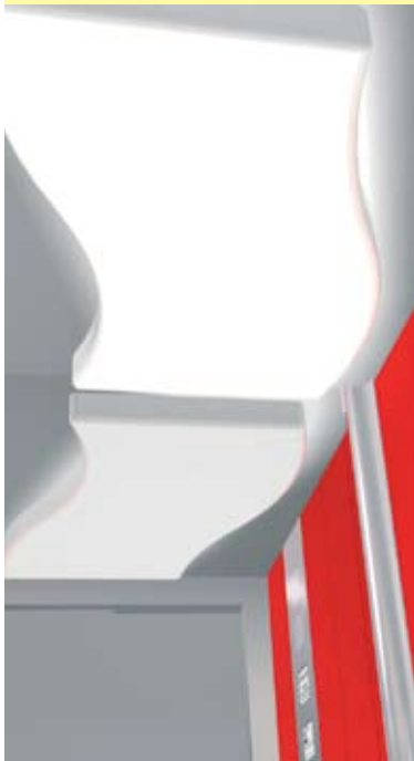
detail of the ceiling ONDA